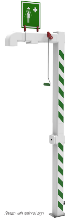
Shown with optional sign

A floor mounted emergency safety shower with pre-insulation and outer jacket to protect the pipework from direct sunlight. Once activated using the pull handle the safety shower will deliver a minimum flow rate of 76 litres per minute of water to effectively decontaminate the casualty. Designed to meet EN15154 and ANSI Z358.1-2014 standards.