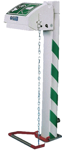
Shown with optional foot treadle

Install this pedestal mounted eye/face wash within 10 seconds reach of a potentially hazardous area. This model benefits from a medium density polyethylene impact resistant outer casing and is pre-insulated to protect the pipework from the effects of frost or direct sunlight. The acrylic capped ABS lid provides further protection to the bowl and diffusers from external contaminants. Complies to EN15154 and ANSI Z358.1-2014 standards.