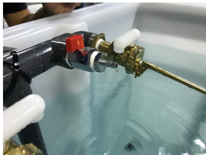
Adjusted setting set to a quicker water dumping rate allowing steady flow of water from the frequency valve