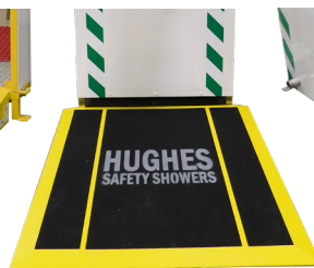
1215mm x 1215mm GRP safe area demarcation zone anti-slip panel