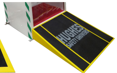
900mm X 1000mm X 215mm for cubicle showers