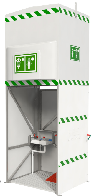
Shown with optional GRP panels and eye wash

For indoor use, this jacketed and insulated model assists in maintaining a steady water temperature within the tank.