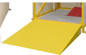
1215mm X 465mm X 40mm for tank showers/cubicles with foot grating